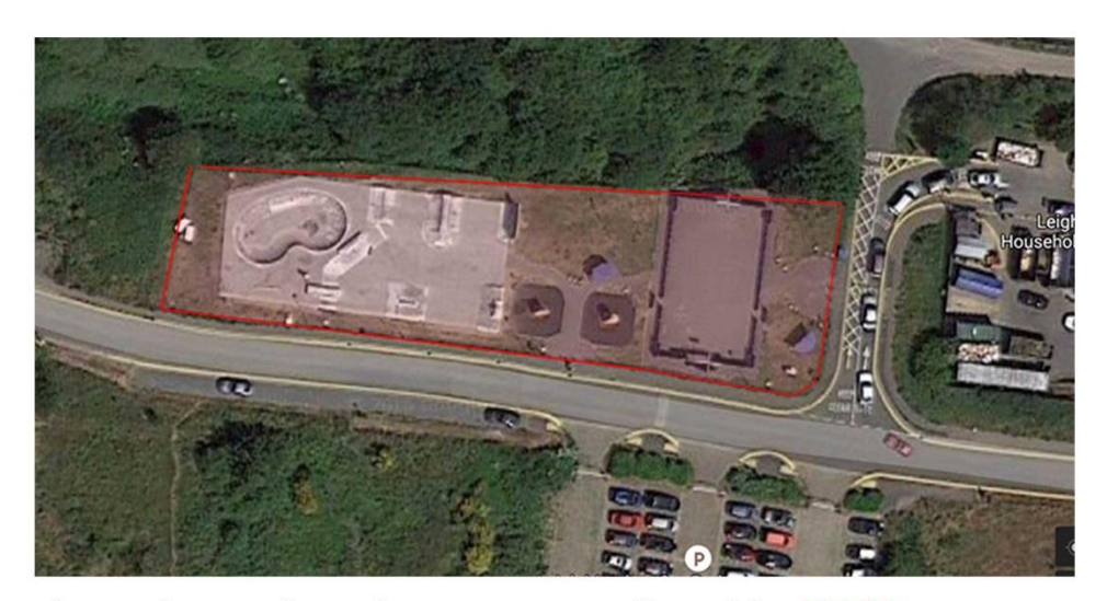
Area for redevelopment outlined in RED

New design - Gravity skateparks - http://www.gravityparks.co.uk